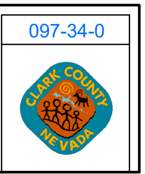
TAX DIST 100