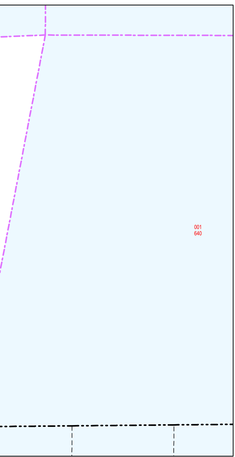
TAX DIST 100